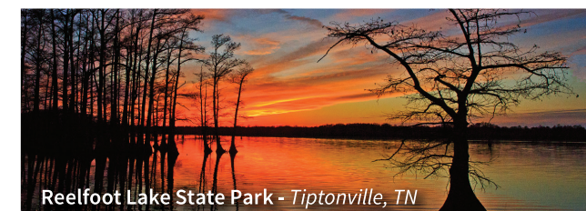
Reelfoot Lake State Park - Tiptonville, TN