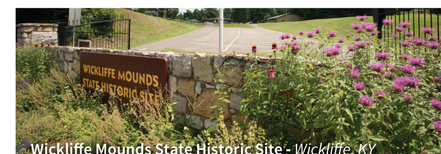
Wickliffe Mounds State Historic Site - Wickliffe, KY