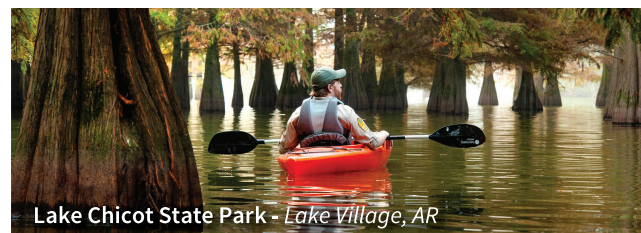
Lake Chicot State Park - Lake Village, AR