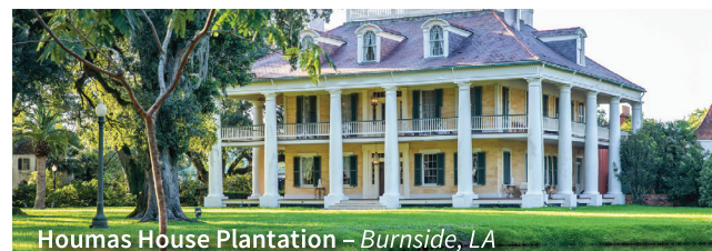
Houmas House Plantation - Burnside, LA