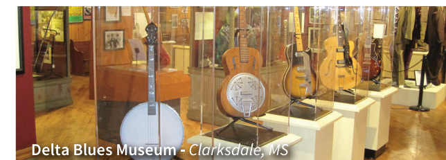
Delta Blues Museum - Clarksdale, MS